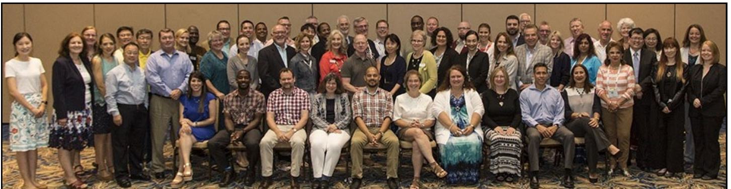
IAFP 2017 Affiliate Council Delegates and Representatives

*Delegate is currently not an IAFP Member, as of April 1, 2018 (a requirement under IAFP Bylaws).