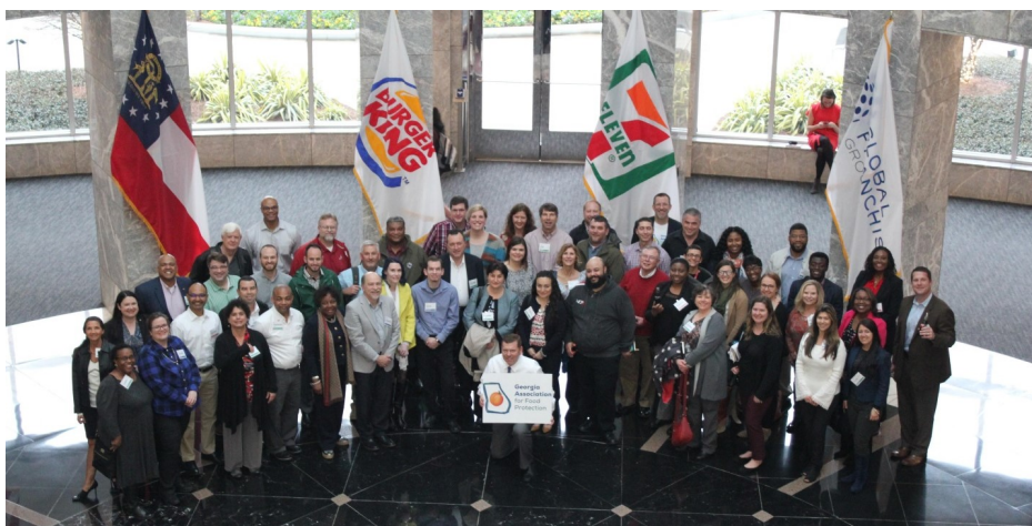
GAFP Members and attendees take a break during the GAFP 2018 Spring Meeting to pose for a group photo. The meeting was held at Coca-Cola Headquarters in Atlanta, Georgia.